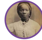
Sarah Forbes Bonetta